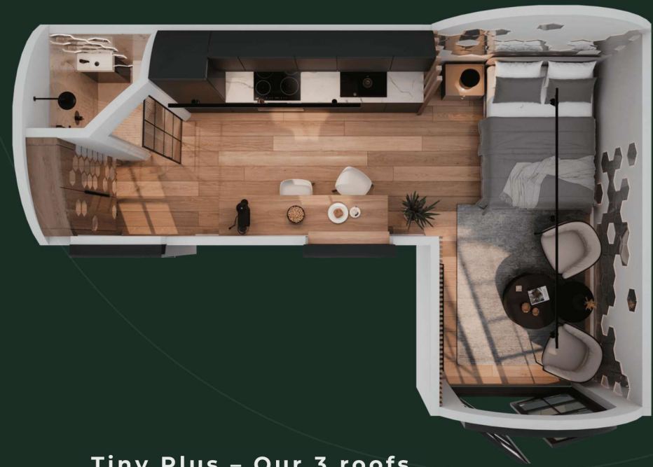
Tiny Plus – Our 3 roofs