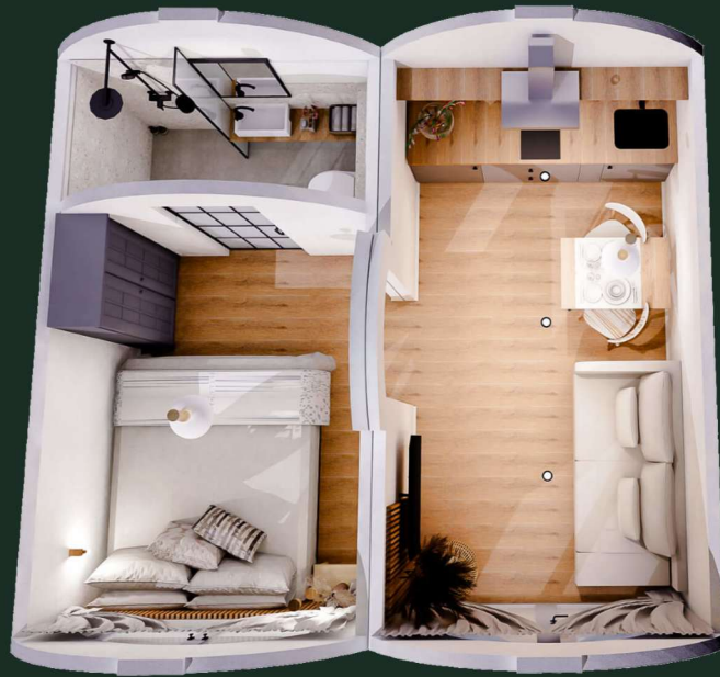
Hobbit – Green roof