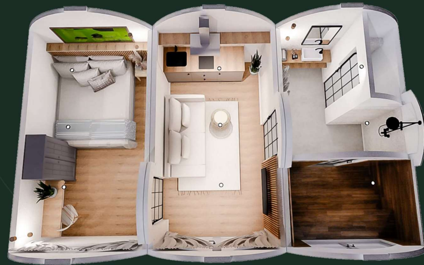
Option B with sauna